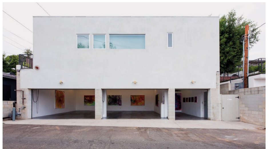
Garage Galleries Thrive in Car-Bound Los Angeles