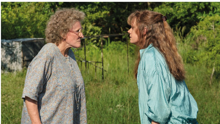
Hollywood Crawls Out of the Trump Era